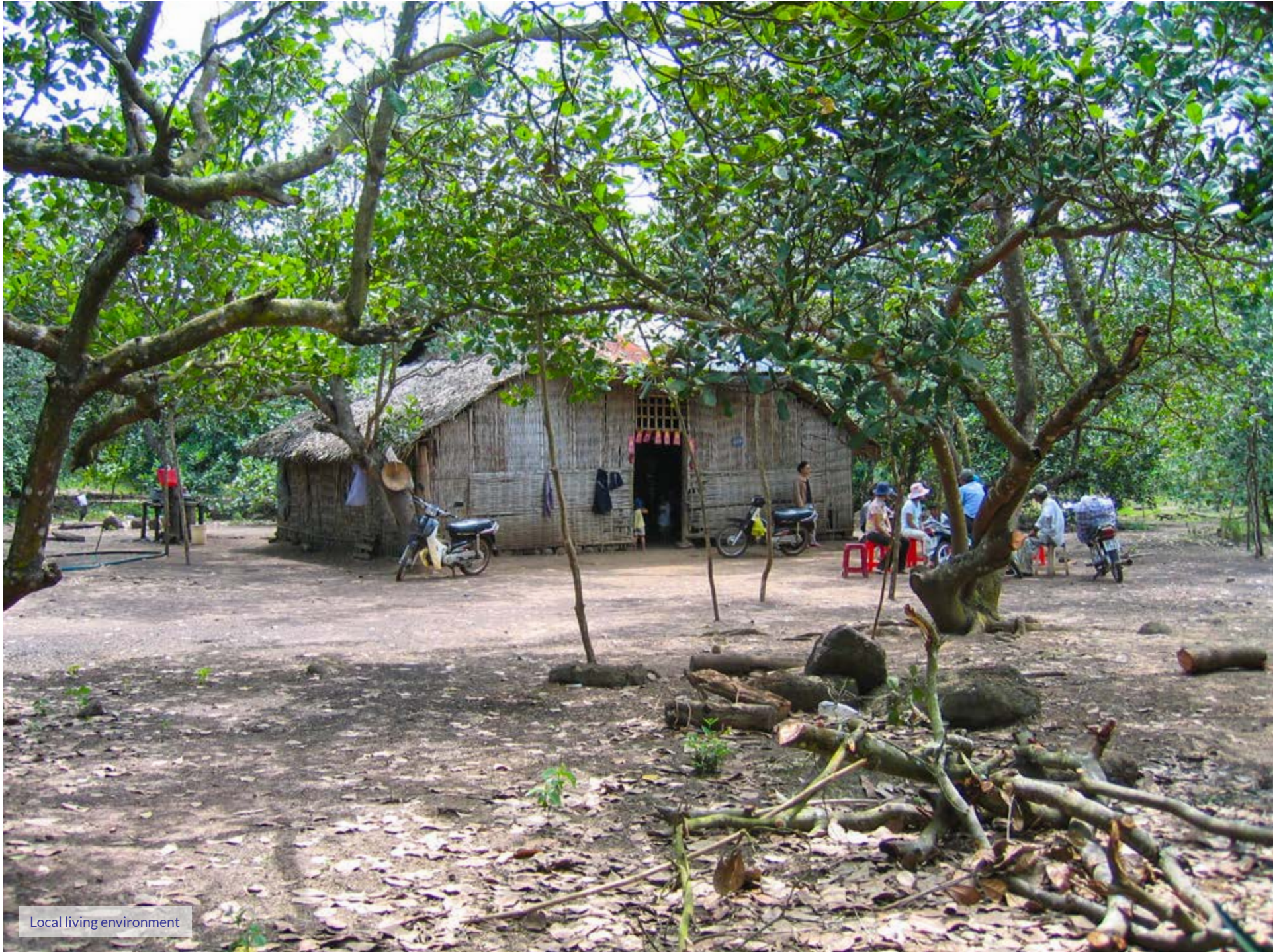
Local living environment