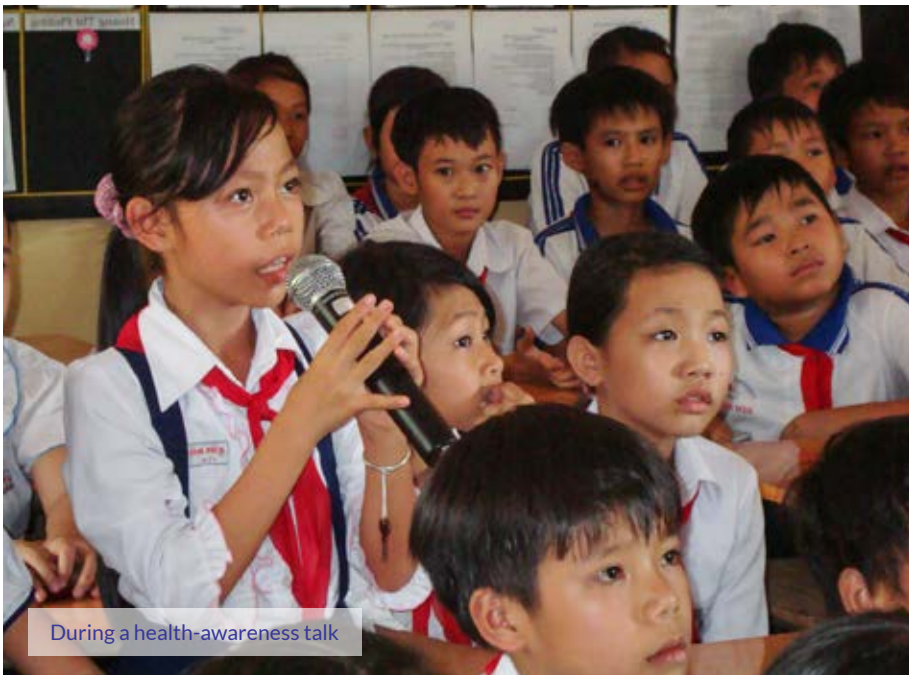
During a health-awareness talk