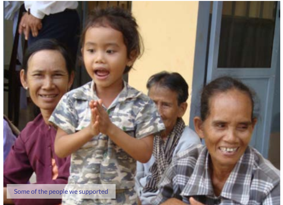
Some of the people we supported