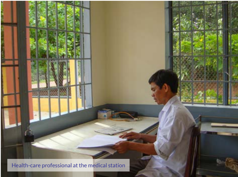
Health-care professional at the medical station