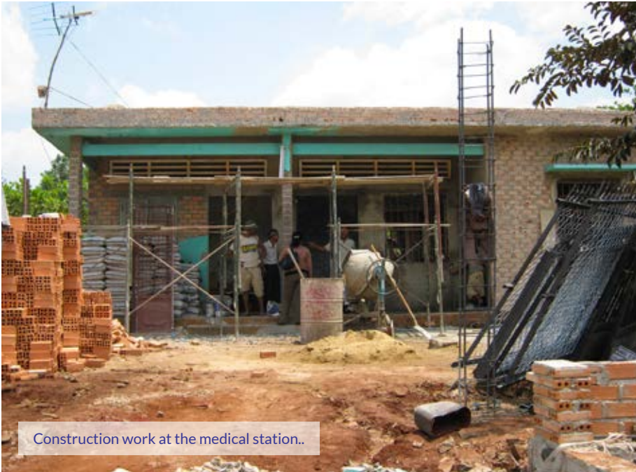
Construction work at the medical station..