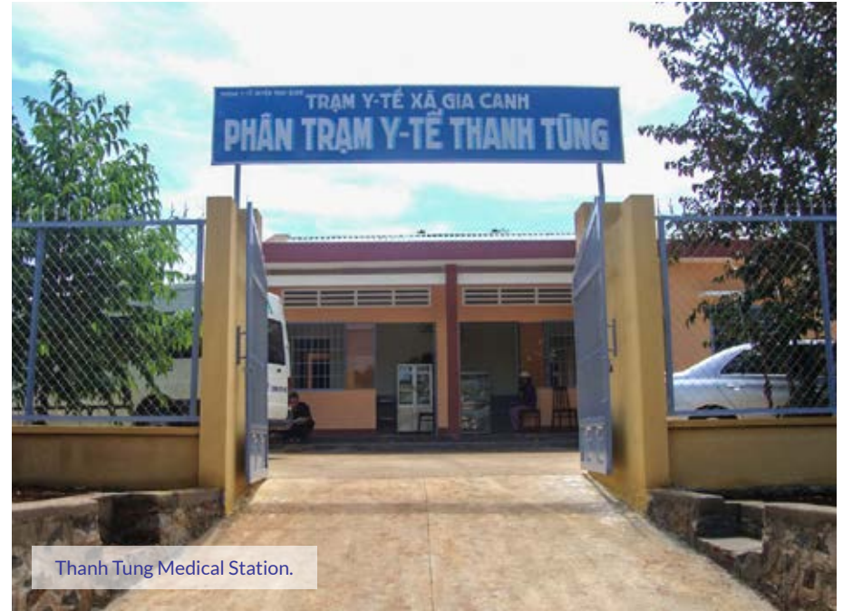
Thanh Tung Medical Station.