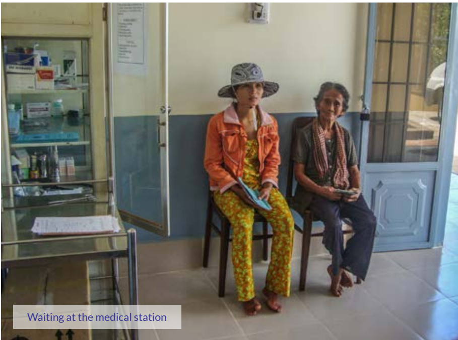
Waiting at the medical station